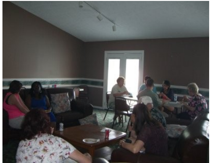
We have cuisines ranging from American, Mexico to India and Italy.