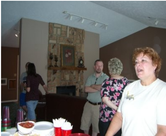
Approximately 15-20 residents showed up at the event.